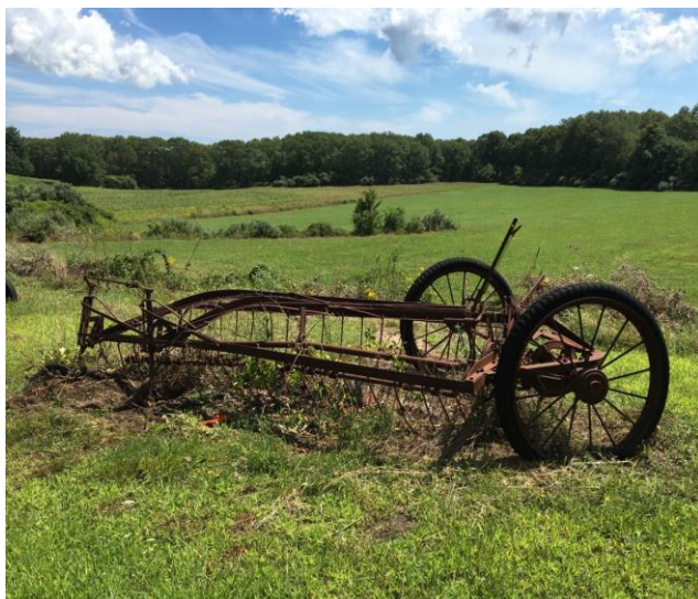
Healey Farm